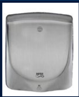
BRADLEY BRADEX: High Speed Surface-Mounted ADA Compliant Hand Dryer