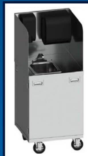
Elkay: Touchless Handwashing Station with faucet, soap disp. And towel dispenser