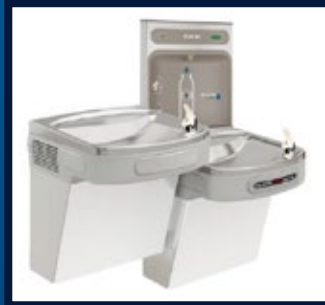
Elkay: Bi-level Touchless Water Cooler With Bottle Fill Station