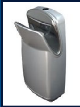
BRADLEY 2921-5000H: Aerix+ High Speed, Vertical Dual-Sided Hand Dryer, High Impact ABS, Silver 10-12 second dry time, Adjustable speed.