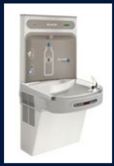
Elkay: Touchless Water cooler with bottle fill station