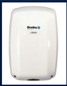
BRADLEY 2901: Adjustable motor Sensor Operated warm air hand dryer